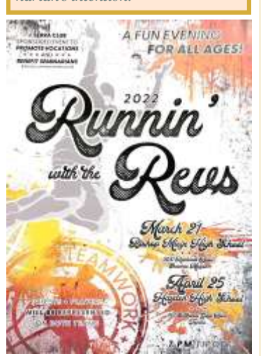
In case you missed it at Miege High School, catch Runnin' with the Revs at Hayden High School, 7:00 PM, Monday, 4/25/2022! Check the website for details.

Mark your calendar with Seminarian Birthdays and pray for the seminarian's intention.