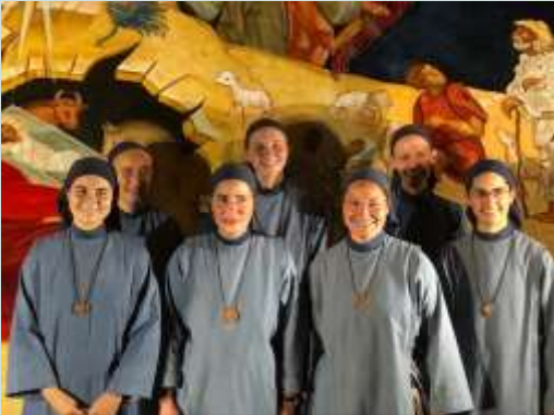
Little Sisters in the Grotto

God, it seems, has a way of disrupting life for the better.